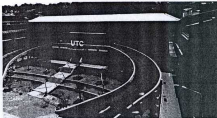
Location, UTC Hotel Semarang